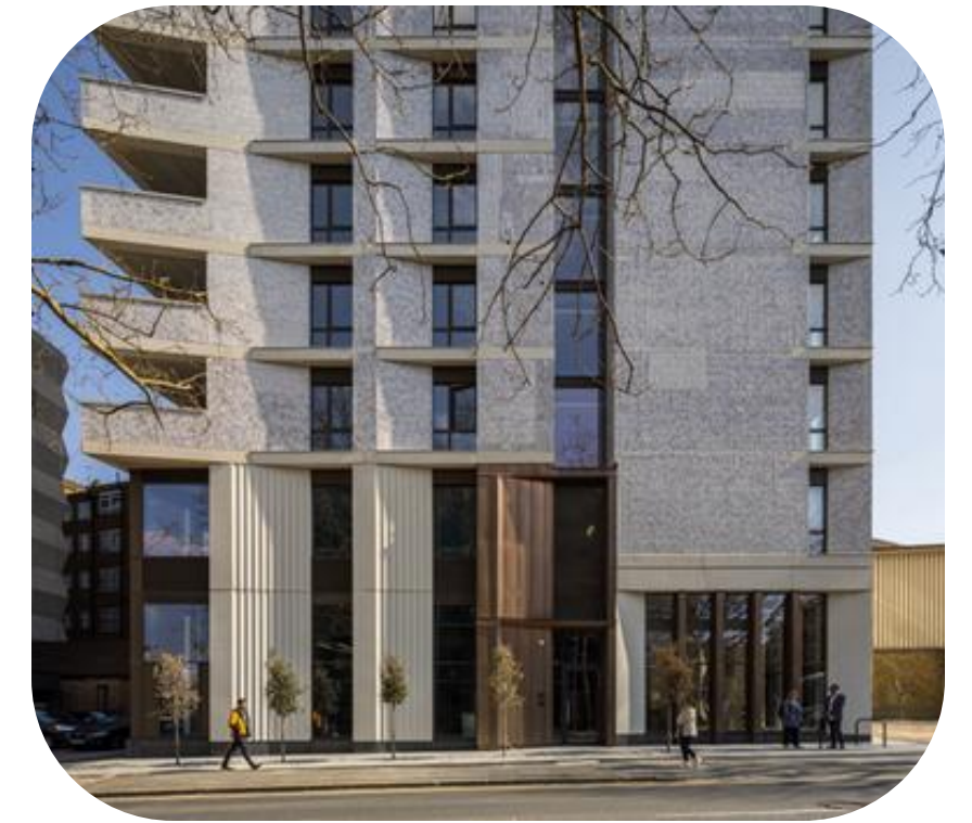
ADDISCOMBE GROVE, CR0 East Croydon