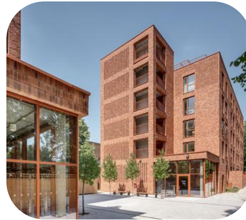
WOODSIDE PARK, N12 Finchley