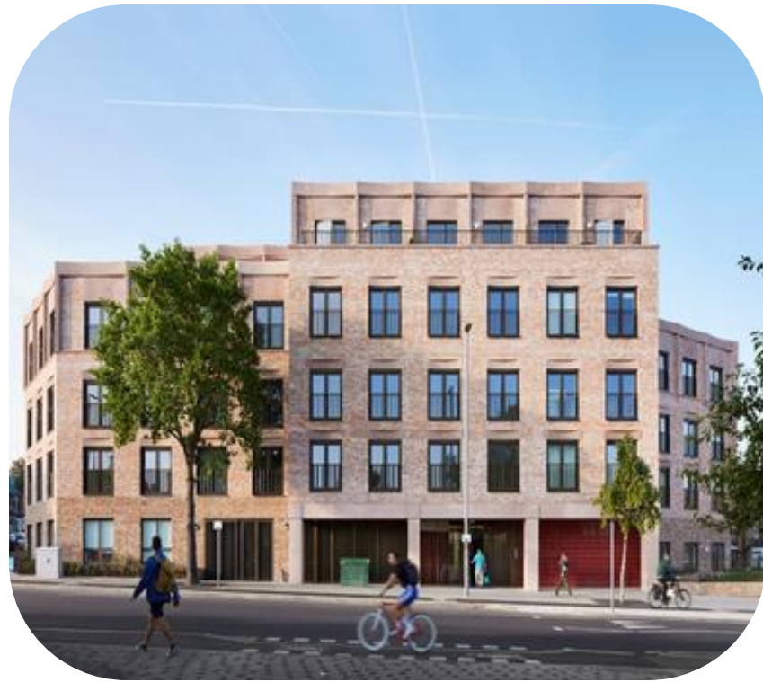
FOREST ROAD, E17 Walthamstow