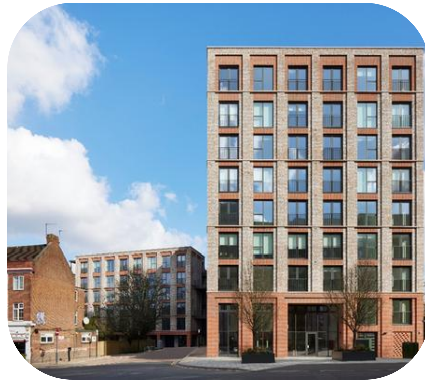
SHEEPCOTE ROAD, HA1 Harrow